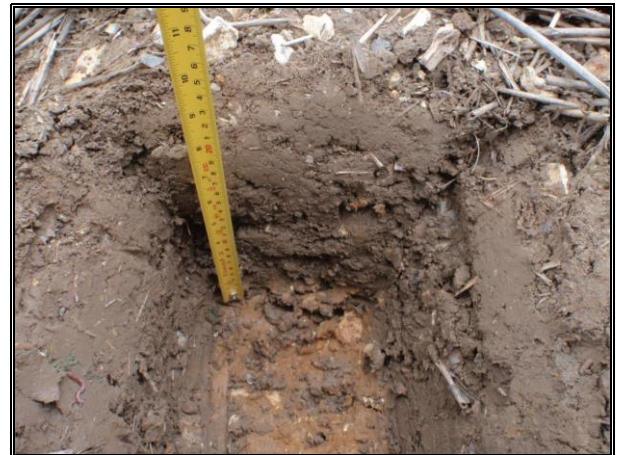
Plate 12 : Soil Profile 1 at TH19 (agricultural soil)