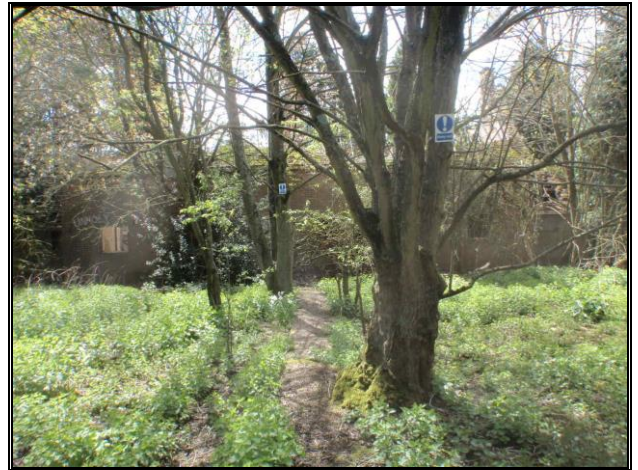
Plate 6 : Access corridor – derelict farm buildings