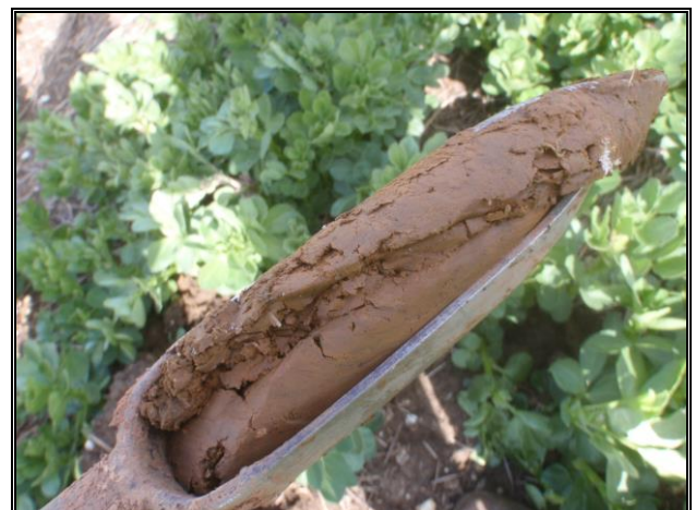
Plate 14 : Subsoil arisings