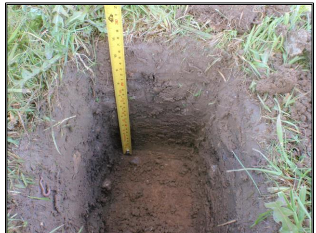
Plate 21 : Soil Profile 3 (Parkland Soil) at TH25