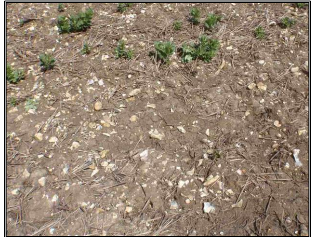
Plate 10 : New country park – soil surface (agricultural land)