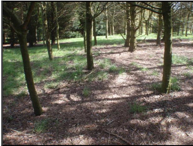
Plate 5 : Access corridor – Pine plantation