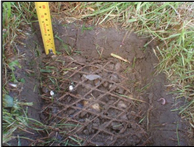
Plate 22 : Soil Profile 3 showing 'no dig' marker layer at TH23 (70mm below surface level)