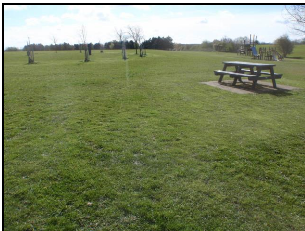
Plate 1 : Wigmore Park (amenity grass)

The main part of the new country park was located east of the old Winch Hill Farm and was comprised entirely of existing agricultural land (arable).