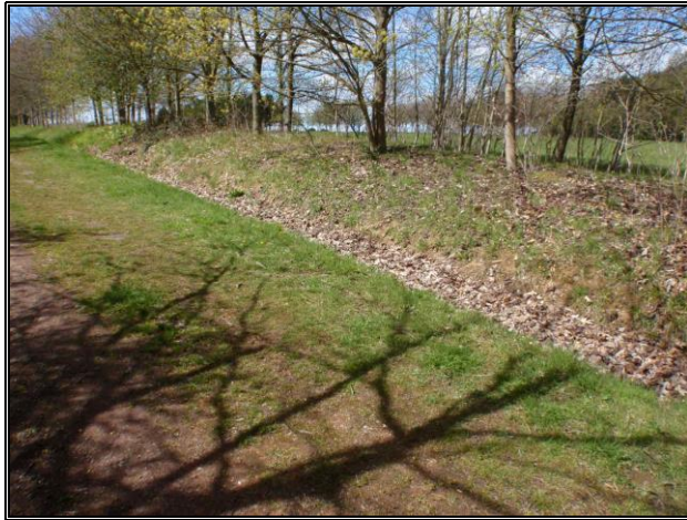
Plate 3 : Earth bank on eastern boundary to Wigmore Park