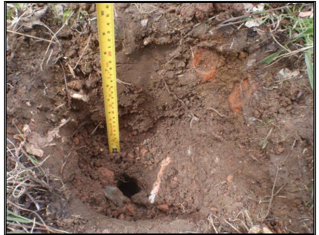
Plate 23 : Soil Profile 3 showing brick fragments at TH37