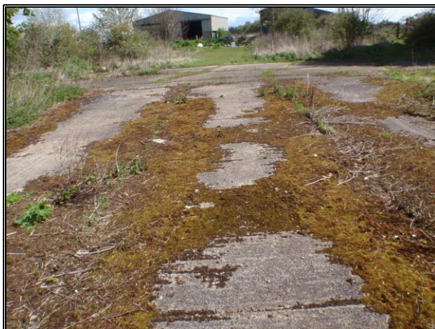
Plate 7 : Access corridor – area of old hard standing