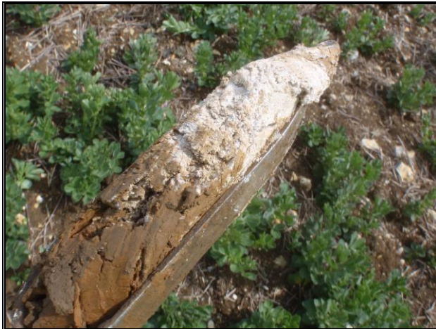
Plate 19 : Soil Profile 2 – Chalk