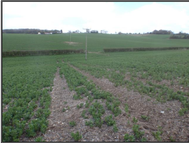
Plate 9 : New country park – southern section, looking east (agricultural land)