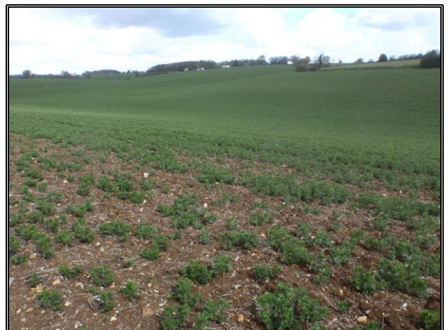
Plate 8 : New country park southern section, looking north (agricultural land)