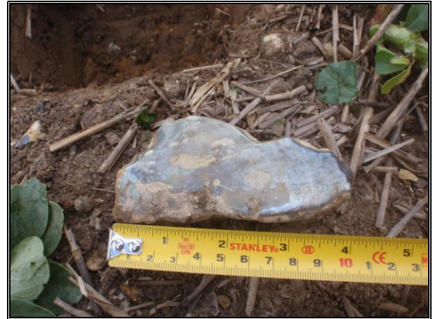
Plate 16 : Soil Profile 1 – large subangular flint