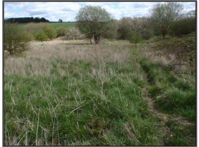
Plate 4 : Access corridor pocket of rough grass and scrub