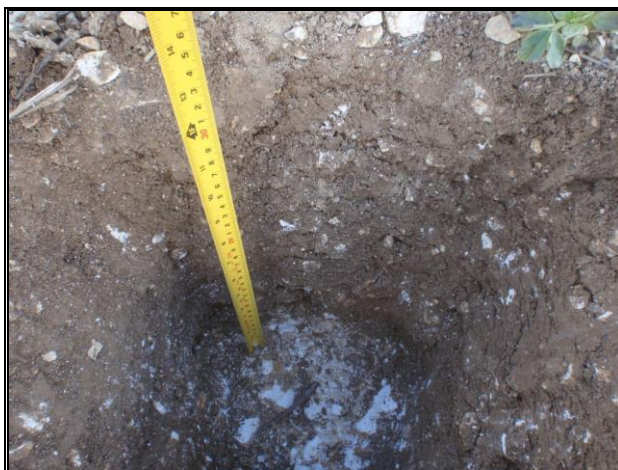
Plate 17 : Soil Profile 2 at TH8 - agricultural soil (calcareous)

Very pale brown (Munsell Colour 10YR 8/3) dry fractured CHALK.