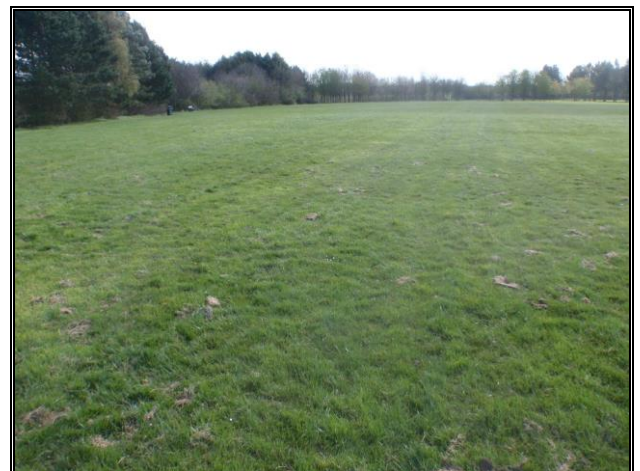
Plate 2 : Wigmore Park (amenity grass)