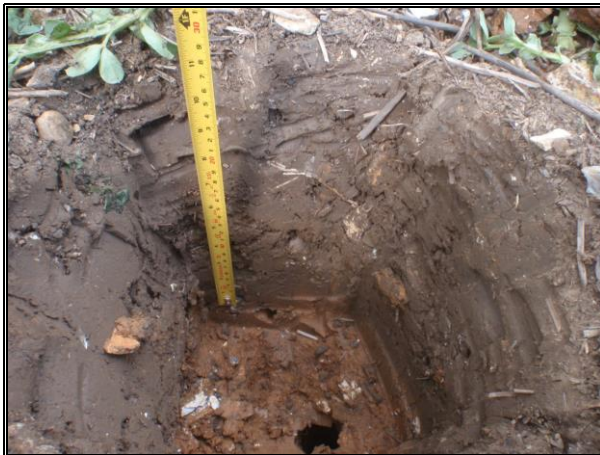
Plate 11 : Soil Profile 1 at TH1 (agricultural soil)

Ochreous mottling and manganese concretions recorded throughout the subsoil, becoming stronger with depth.