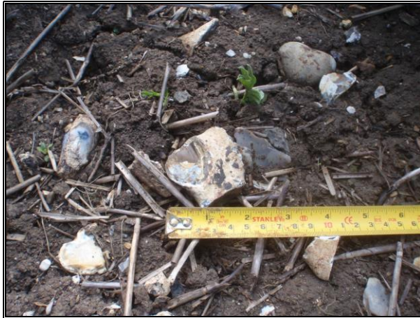
Plate 15 : Soil Profile 1 - subrounded flints