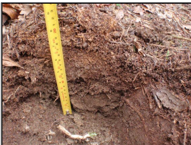
Plate 24 : Soil Profile 4 showing litter layer at TH32 (Woodland Soil)

Subsoil described as Soil Profile 1 Subsoil