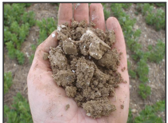
Plate 18 : Topsoil 2 arisings - agricultural soil (calcareous)