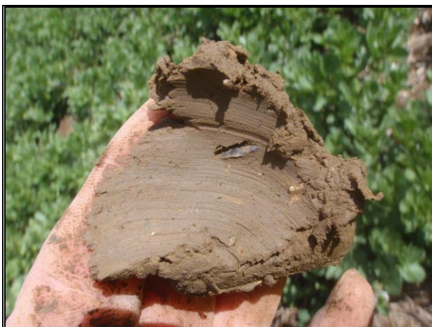
Plate 13 : Topsoil 1 showing plastic consistency