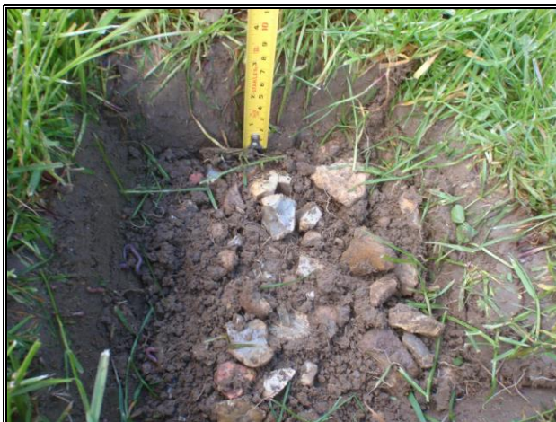
Plate 20 : Topsoil 3 showing stone layer at 90mm below surface level (TH24)

Subsoil described as Soil Profile 1 Subsoil